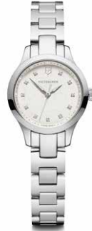
241875 * Ø 28 mm