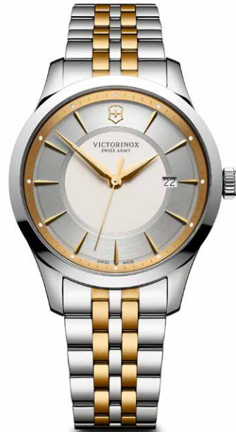
241803 Ø 40 mm