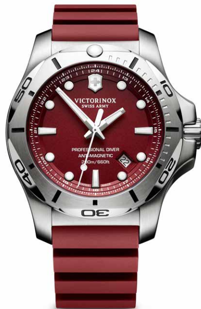
241736 Ø 45 mm