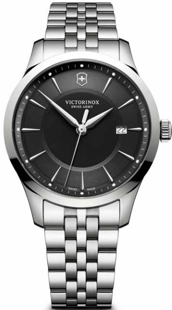
241801 Ø 40 mm