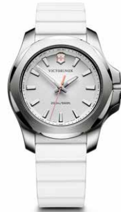
241769 Ø 37 mm