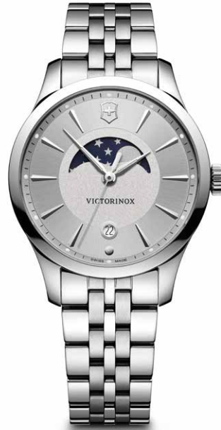
241833 * Ø 35 mm

Stainless steel bracelet (316L) PVD treatment on bracelet**