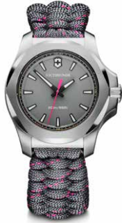
241771 Ø 37 mm