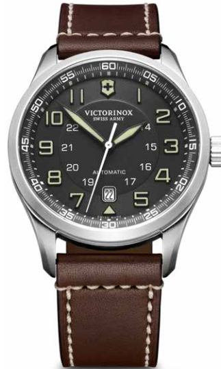
241507 Ø 42 mm

Genuine leather strap Fabric strap with iconic red stitching