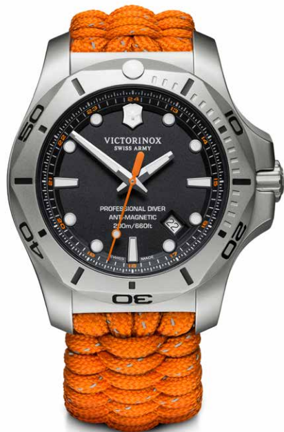
241845 Ø 45 mm