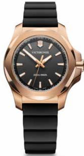
241808 Ø 37 mm