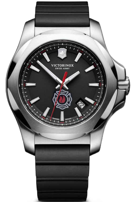
FIRE DEPARTMENT NEW YORK

The company logos printed herein are shown for demonstration purposes only and remain property of the respective company.