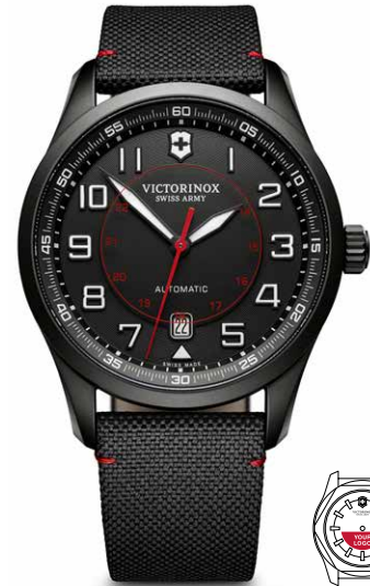
241720 * Ø 42 mm