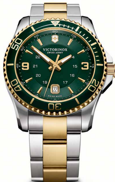
241605 * Ø 43 mm