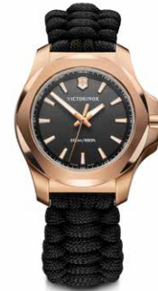
241880 Ø 37 mm