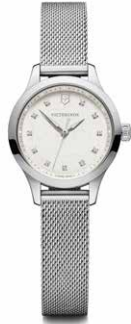
241878 ** Ø 28 mm