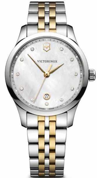
241831 ** Ø 35 mm